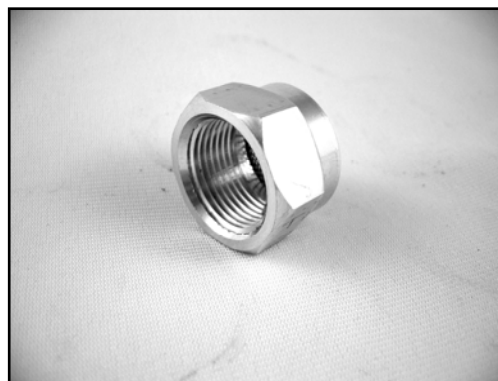
↑Pipe Cap (5/8" – P/N: RV706-625DTE) or (3/4" – P/N: RV706-750DTE) or (1" NPT – P/N: RV706-1000DTE)↑

Other sizes and styles available upon request