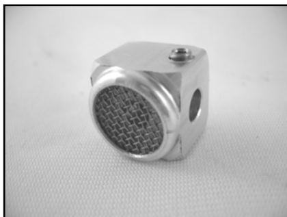
↑Angle Vent (Accepts 3/8" or 1/2" Pipe – pipe cap w/ set screw) (P/N: RV706-375DTE or RV706-250DTE)↑