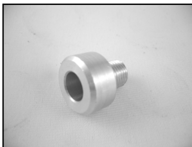
↑Straight Vent with drip ring (1/4" NPT - P/N: RV706-25D) ↑